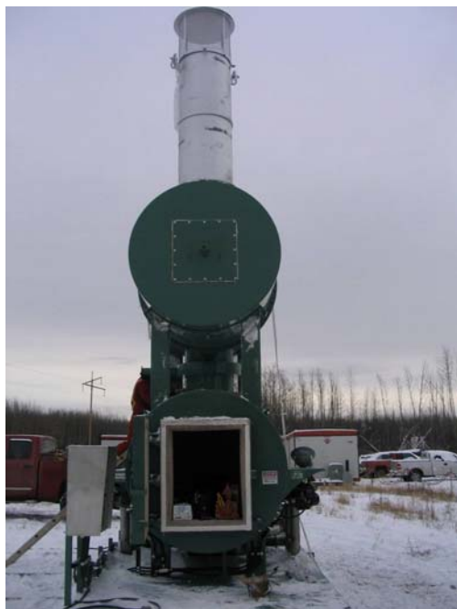
Figure 2.2 Typical Controlled Air Dual Chamber Incinerator